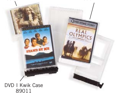
DVD I Kwik Case 89011

DVD and CD Quattro cases fit in any of our Kwik Case configurations, allowing you to economically increase storage capacity.